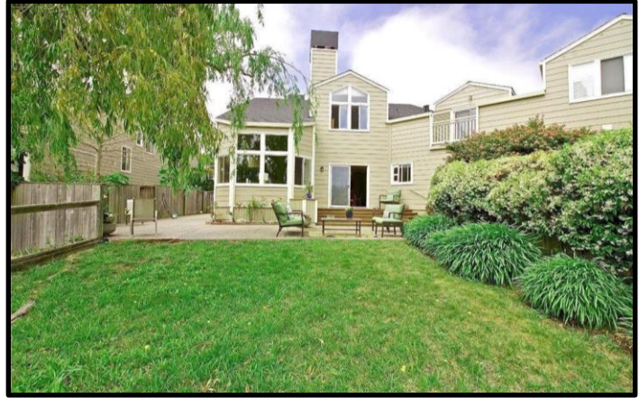
The new Rectory at Parkview Circle in Corte Madera

On July 8, Church of Our Saviour finalized the purchase of a 3 bedroom/2.5 bathroom, 1600-square-foot townhouse on Parkview Circle in Corte Madera. This attractive property was built in 1990, needs minimal maintenance, is in a well-managed homeowner association, has excellent area amenities, is situated in an outstanding school district, and offers easy access to Mill Valley. It is a short 12-minute drive from Church of Our Saviour. The vestry was unanimous in its consent for this purchase, the Helmers are delighted, and they moved in early August.